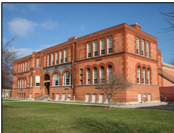
The Old Schoolhouse ca. 2008

Deemed to be beyond reasonable repair costs and as an ever-increasing financial burden to the school district, the building and its 1916 addition were demolished in July 2008. The property then became a community center known as Commodore Square.