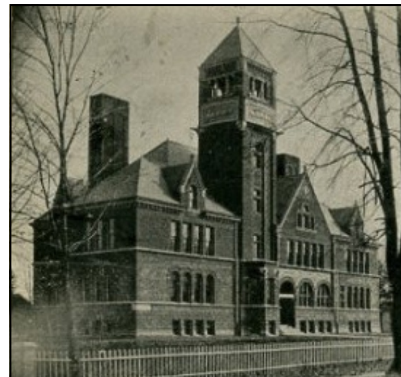
The Old Schoolhouse ca. 1900

A typical feature of that style is the building's large square bell tower (or belfry) with the pointed top that rose from a three-sided bay to the left of the main entrance. This tower was 80 feet high and could be seen from all over town. It was also a temptation for enterprising students who occasionally climbed up it to hang their graduating class banner from the belfry.