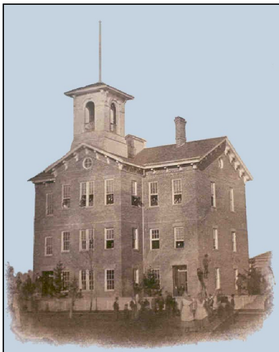
The 1849 Schoolhouse as it appeared ca. 1890

news article it pointed out that this was never a suitable building for school, that "its long stairs (to the third floor) have been the cause of the death of many a young lady who might be a healthy, happy woman today" (an apparent exaggeration), and that its bad lighting was the reason a great number of people in town were wearing glasses (perhaps some truth in this?). The newspaper editor seemed to be both sorry and glad it burned down!